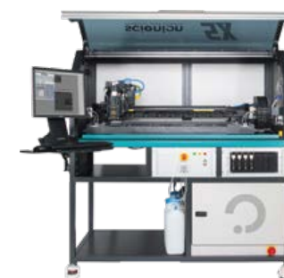
● High Scale Batch