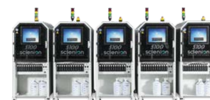
● In-Line High-Throughput