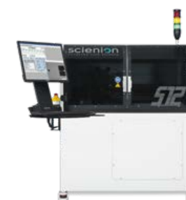
● Medium Scale Batch